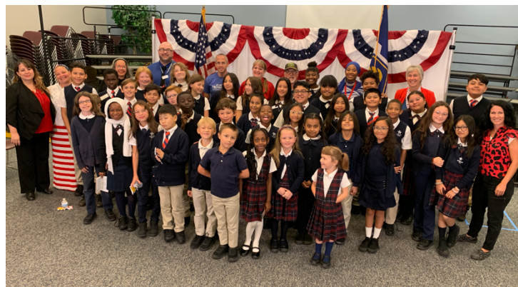
Our wonderful 2024 Constitution Day live stream readers!