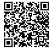
Example QR Code

It is critical this year that every parent be confident in some basic tech skills. This week's focus: QR Codes and text messages. If you aren't able to do these things, please ask a friend, a smart kid, or call the school for some help.