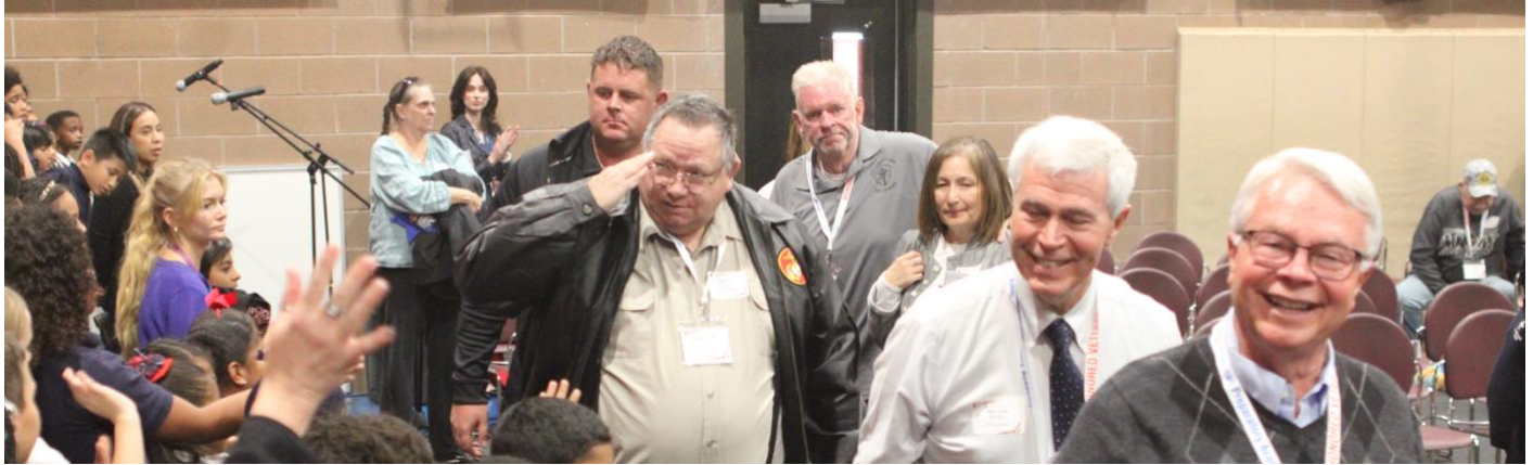
Monday's Veterans Day Celebration – Walk of Honor