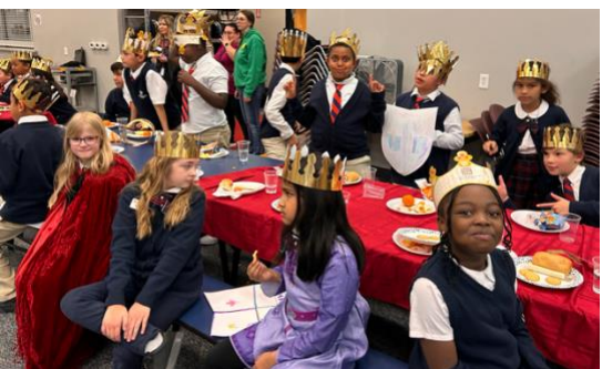
Before the break, 4th Grade celebrated the completion of their World Civilizations unit in History with a Medieval Festival