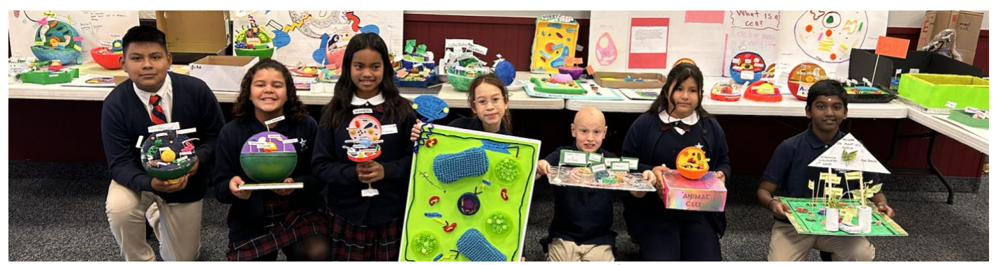
Some of the AMAZING cell models created by the 5th grade!

American Prep-West Valley 1: 801-839-3613 / Website @ https://westvalley1.americanprep.org/